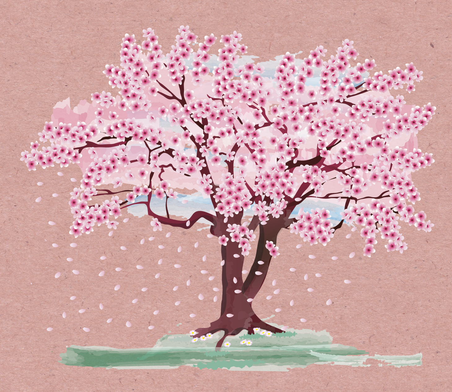
Above and Beyond Education