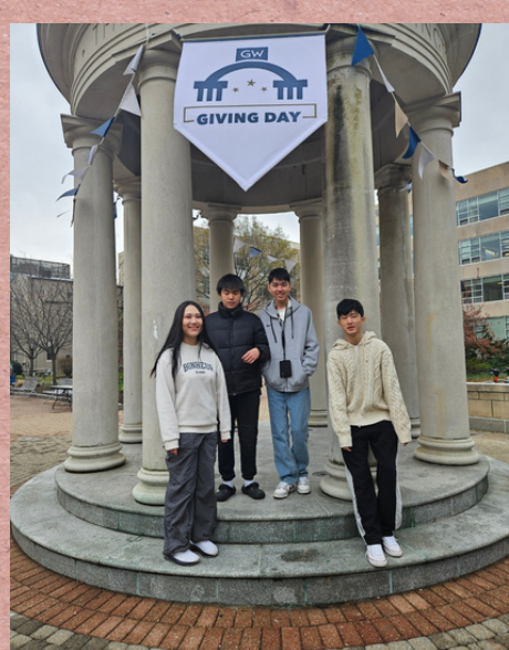
Above and Beyond Education