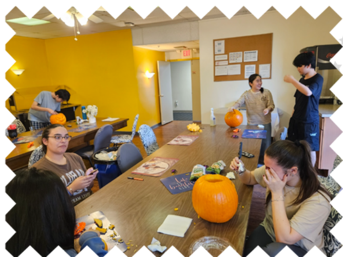
Above and Beyond Education